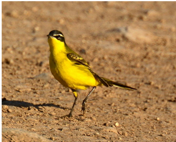
Yellow Wagtail ( flava )