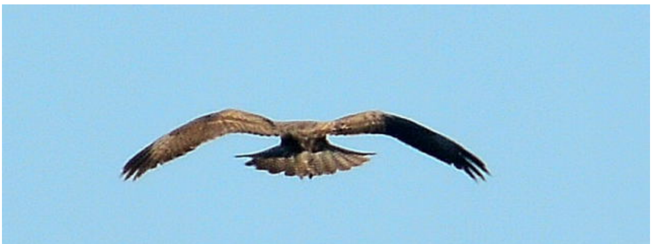
Long-legged Buzzard in typical hovering mode