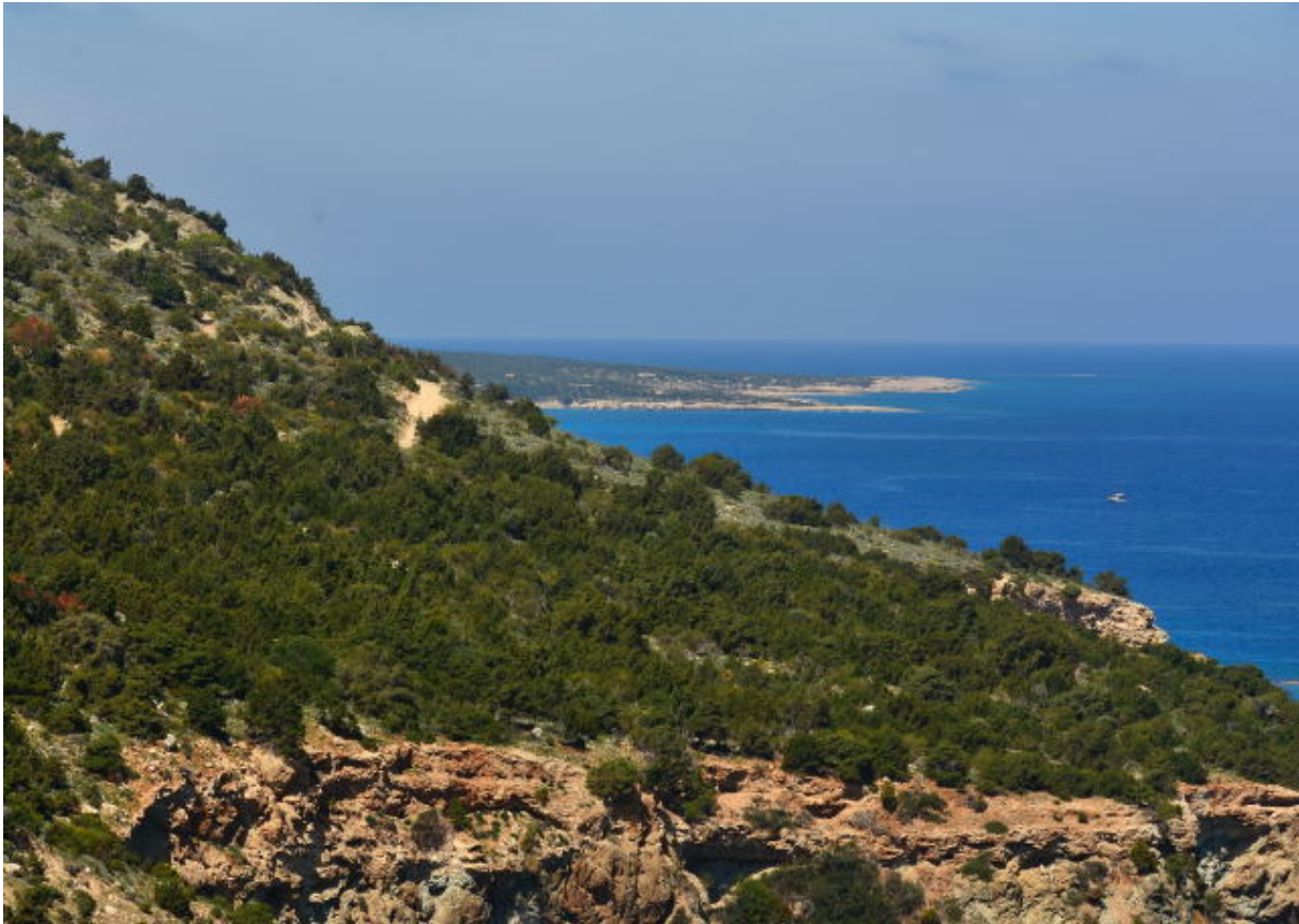
View of Akamas Peninsular