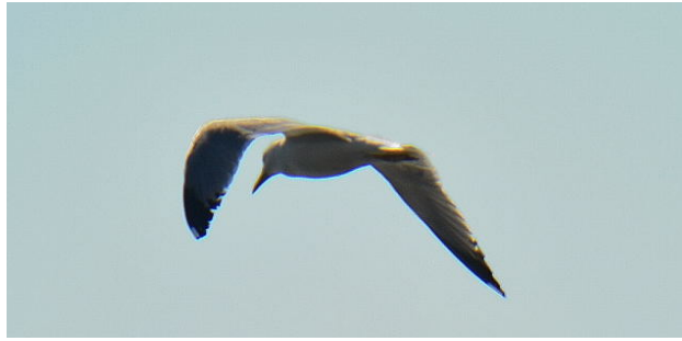
Slender-Billed Gull (record shot)