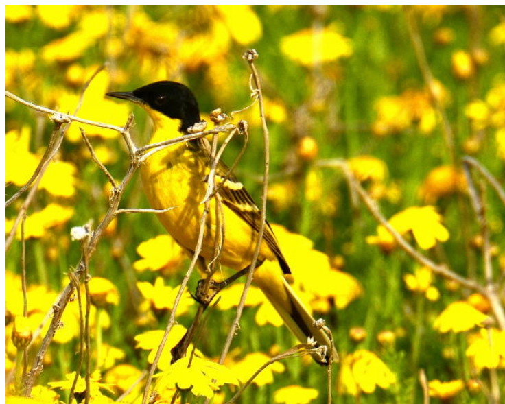
Yellow Wagtail ( feldegg )