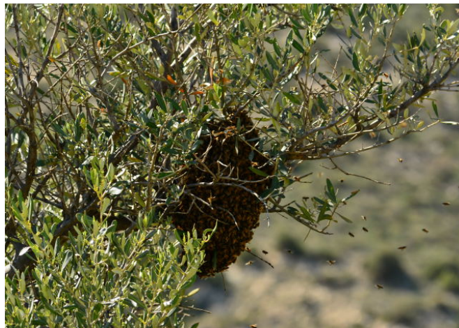
Swarm of Bees in village, time to go!