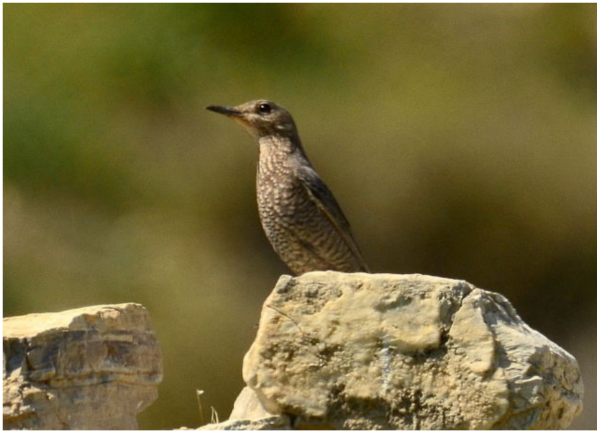
Blue Rock Thrush